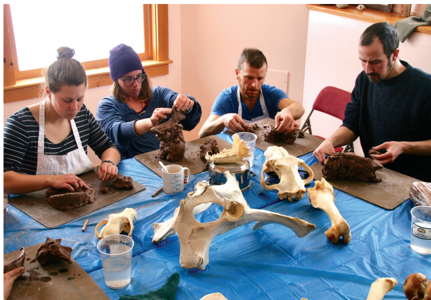
Winter course students modeling animal bones in clay.

columns of the animals, one being a cow, I went to the farm and looked at the backs of the cows in a whole new light. I began to imagine the internal structure that forms their bodies and recognize the internal structure within the cow as a whole. Thank you so much for the course and for sharing all your knowledge and perspectives with us!